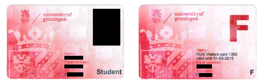
(a) My anonymized student card (b) An anonymized visitors' cardFigure 1: The different types of University Cards

On the outside, the University Card has a several pieces of information printed on it: The card holder's name, their function (one of either Student , Employee or Visitor ), their account-number (starting with respectively S, P or F), a card number and finally a barcode on the back containing a similar yet slightly different number. Additionally, if the card holder is not a visitor their photo is printed on the card. Shown in figure 1 are the front sides of a student card and a visitors' card. Employee cards are visually similar to student cards but differ only by the first letter of the account number and the absence of the word "Student".