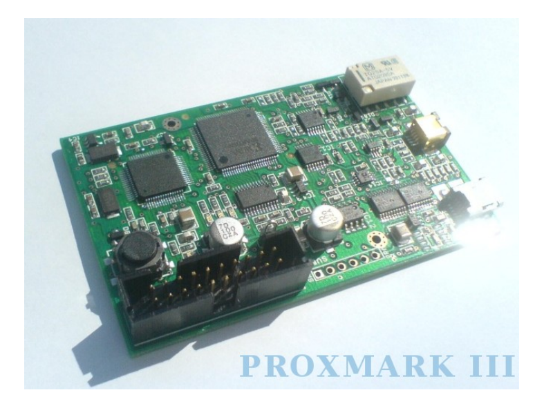
Figure 3: The Proxmark3