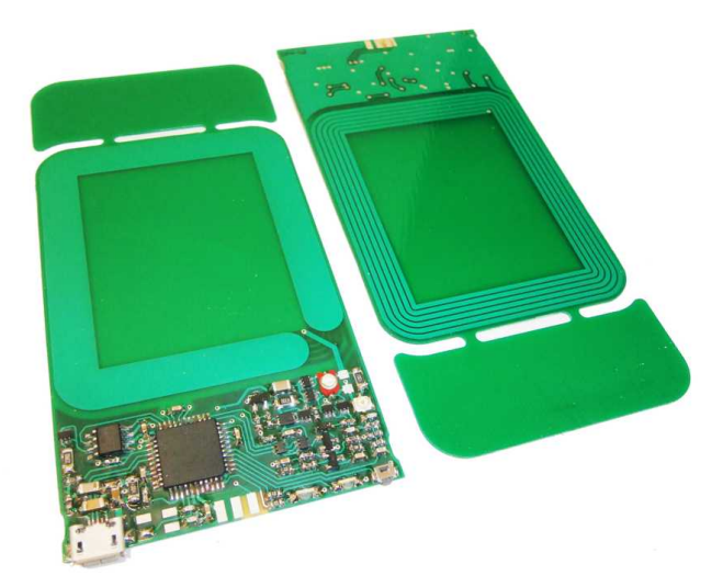
Figure 4: The ChameleonMini