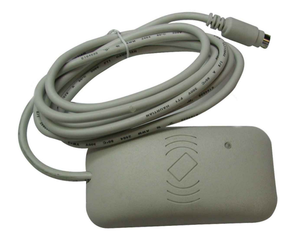
Figure 2: The external Equitrac smart card reader which is attached to every FollowYou printer

Before the introduction of parking abilities linked to University Cards, employees had a separate Mifare Classic-based card to use for entering and exiting parking lots. Once again, the introduction of the University Card seems to be an improvement in terms of security, considering the broken security of Mifare Classic cards.